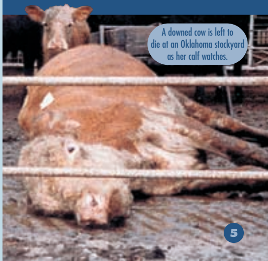
A downed cow is left to die at an Oklahoma stockyard as her calf watches.

interview with a Canadian livestock trucker from A Cow at My Table , 1998 documentary