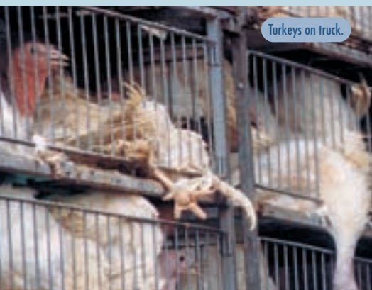
Turkeys on truck.

Transport Crammed together, animals must stand in their own excrement while exposed to extreme weather in open trucks, sometimes freezing to the trailer. 12 These conditions can result in “downers”—animals too sick or weak to walk, even when shocked with electric prods or beaten. Downers are dragged by chains to slaughter or to “dead piles” where they are left to die. 13