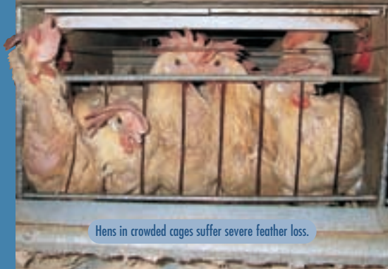
Hens in crowded cages suffer severe feather loss.

Farm Animal Welfare, Iowa State University Press, 1995