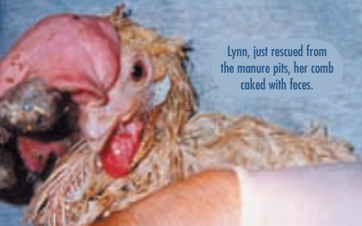
Lynn, just rescued from the manure pits, her comb caked with feces.

With increased knowledge of the behaviour and cognitive abilities of the chicken, has come the realization that the chicken is not an inferior species to be treated merely as a food source.